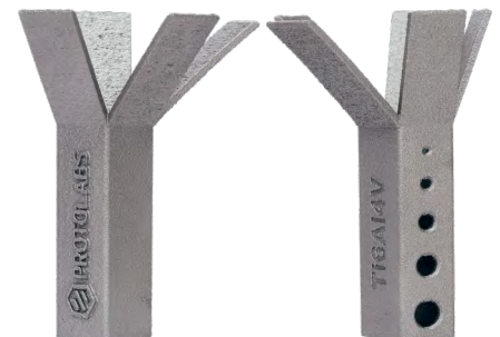
Normal Resolution 60 µm