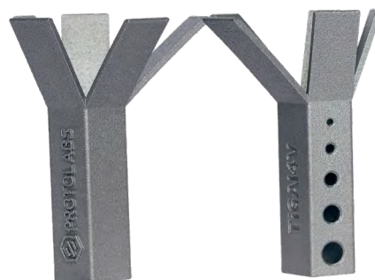
High Resolution 30 µm